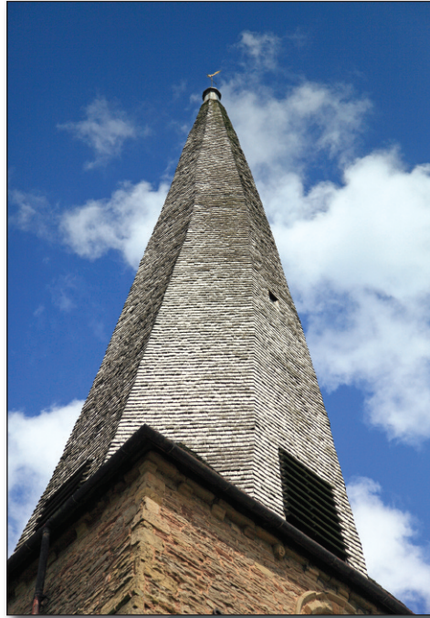
Clebury Mortimer's twisted spire.