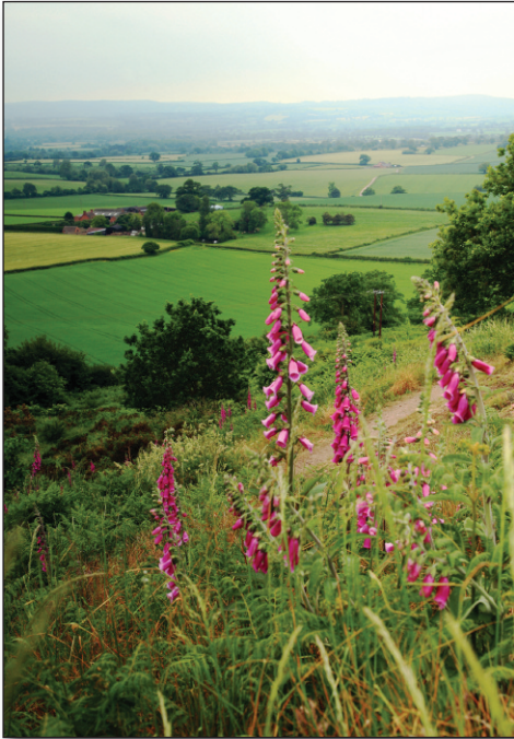
View from Lyth Hill.